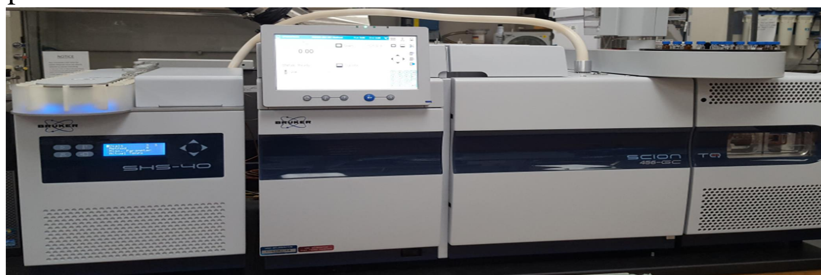
Figure 2: Headspace GC/MS Bruker SHS-40 that was used for analyzing the VOCs.

The plastic samples were obtained from black monochromatic plastic, general household plastic wrappers, plastic utensils, plastic lids from bottles, plastic used for shipping, and known preproduction plastics purchased from Sigma Aldrich which are found in plastics. Some plastics were placed in a grinder along with dry ice to ensure VOCs would not escape when grinded. After they were grinded, they were placed in sealed containers. Headspace vials were filled to ¼ full with the plastic samples. The vial was capped and sealed. The Headspace GC/MS Bruker SHS-40 was used to analyze. Plastics in vials were heated at 80°C for ten minutes in the headspace unit. 1 µL of the gas was then injected into the GC/MS. The GC temperature programs started at 30°C for five minutes and increased at a rate of 20°C per minute to 200°C. Mass spectra of peaks from each chromatogram were compared to the NIST MS-library and to MS from peaks from standard plastics and identified where possible.