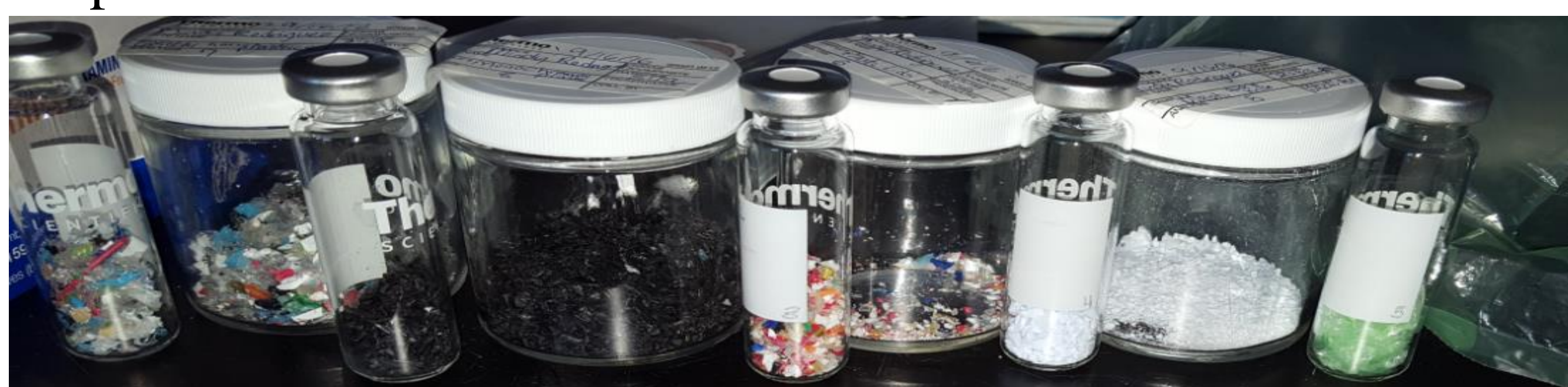
Figure 1: Plastics that underwent GCMS.

World plastic consumption has increased dramatically over the past 60 years yet little research has been done on the chemical compounds escaping plastics. Volatile organic compounds (VOCs) are leaching out from plastics at both elevating temperatures and at room temperature. This research compares VOCs leaching from different plastics and at elevating temperatures.